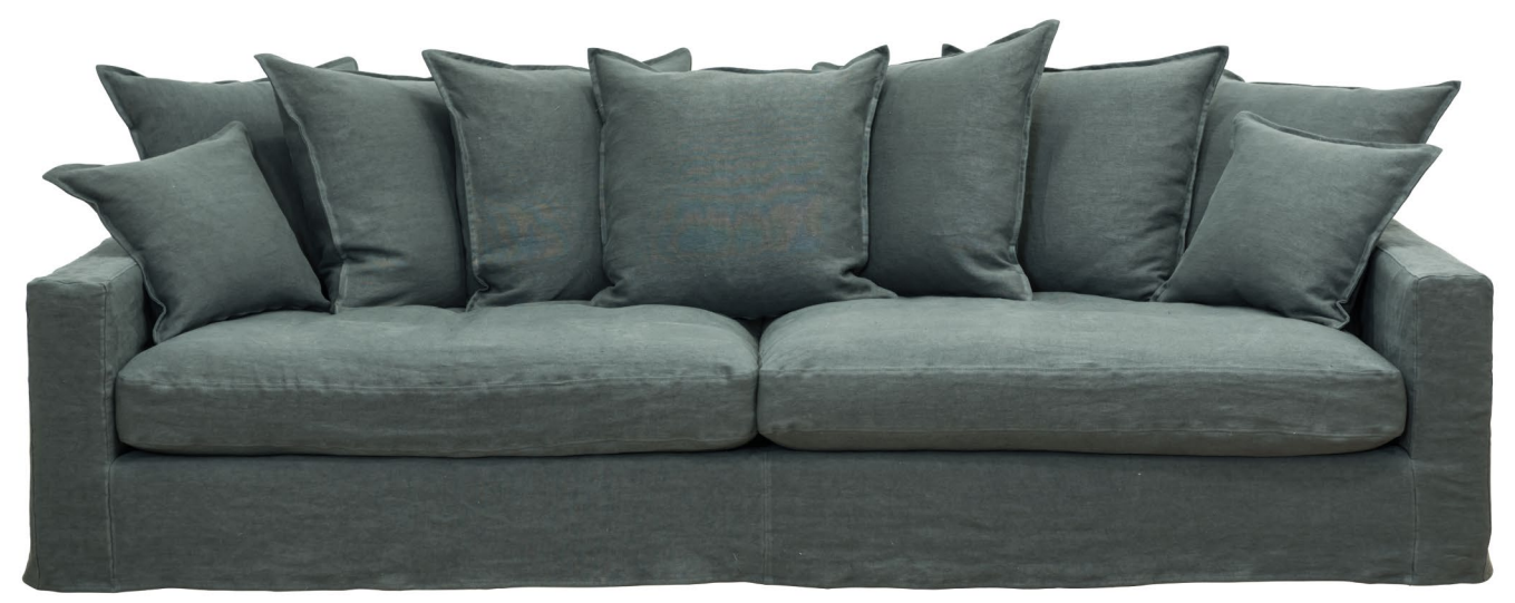
LINO 11231-28 DARK SLATE