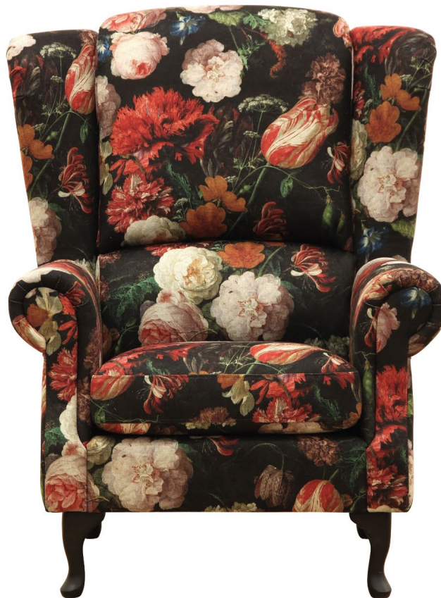
FLORA 14187-79 BLACK VELVET