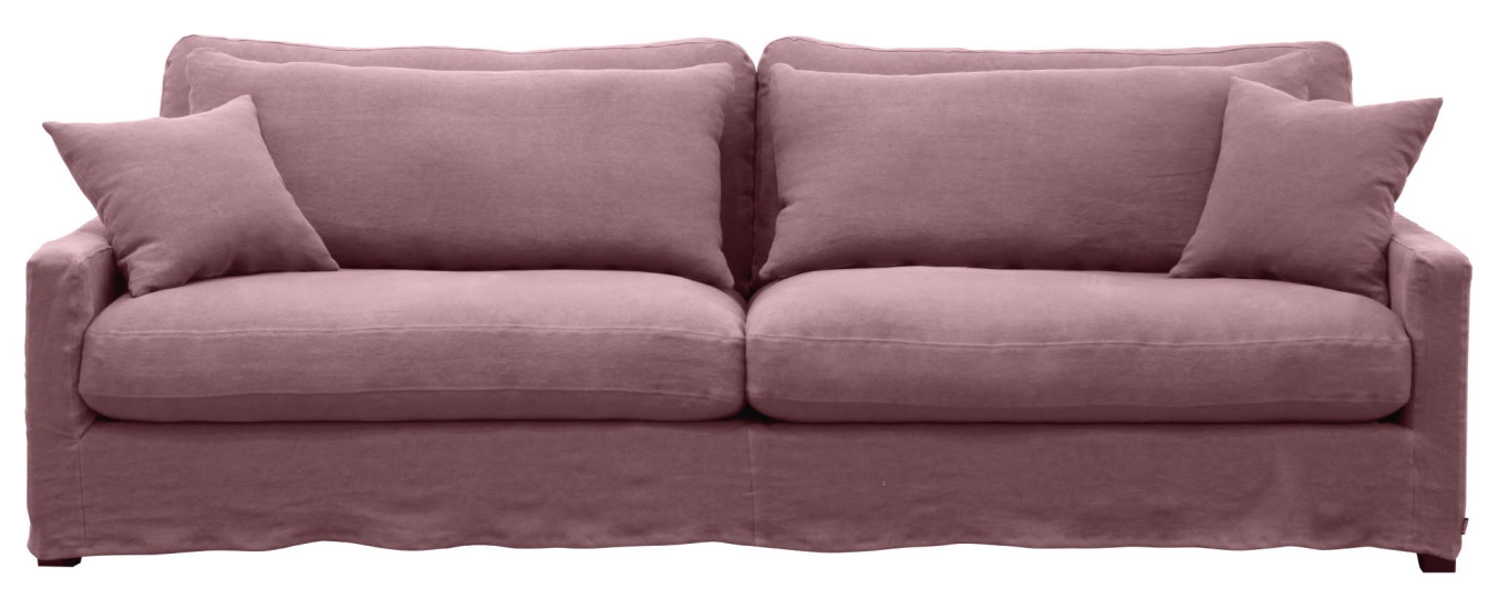
LINO 11231-54 COGNAC